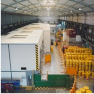
Hall 1/operating phase

In Duisburg-Wanheim, GNS has operated a facility for the packaging of low- to intermediate-level radioactive waste from the operation and decommissioning of German nuclear power plants since 1985. For this purpose, the waste was compacted, dried and packed in containers suitable for interim storage and final disposal.